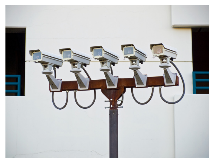
I/Sight works with Security Framework to display and control video management systems.