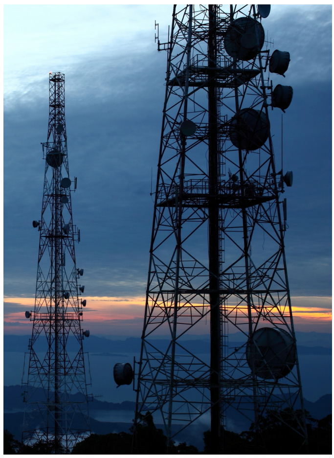
With Security Framework, you can display a variety of data types in a common operating picture.