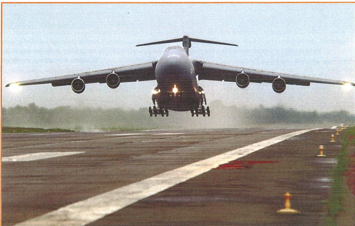
A C-5 Galaxy takes off from an airfield at a forward-deployed location.